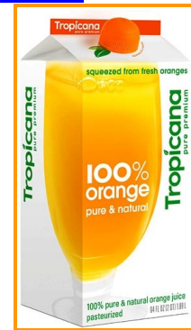
CARTON OF MILK & JUICE