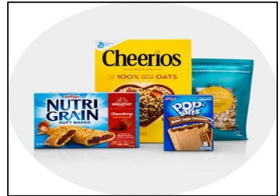
CEREAL & SNACK BOXES